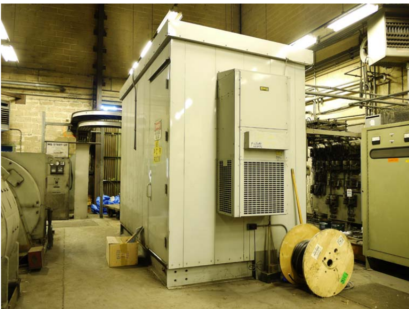
GE 1999 SCR Drive for the 1150HP DC Motor on the 18" Mill