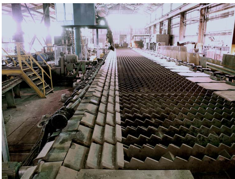
130ft x 15ft-6in Walking Beam Rake Type Cooling Bed