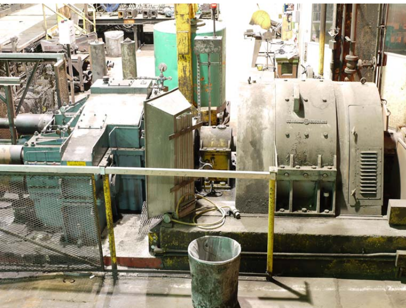
700HP GE 300-900RPM 700VDC Drive Motor for the 12" Mill Stands with new combination gear- pinion stand