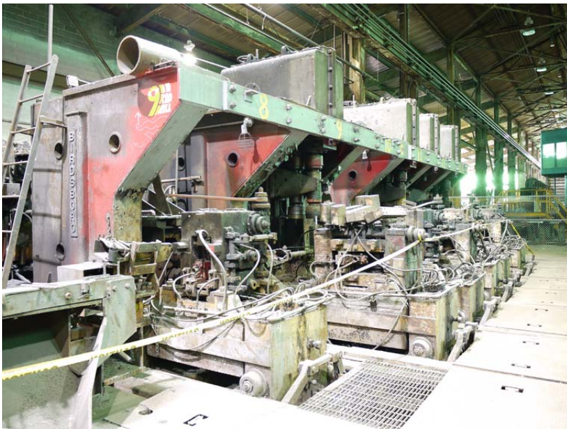
7 Stand Horizontal Vertical 9" Finishing Train driven by 1500HP DC Motor