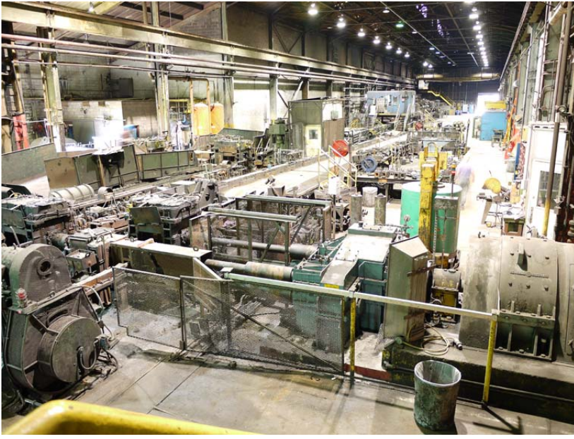
Intermediate Mills Area