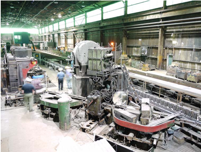
10" Vertical Mill driven by 350HP DC Motor