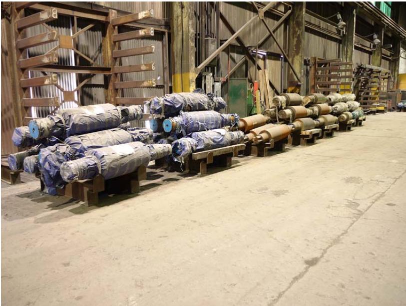
Spare Uncut Mill Rolls